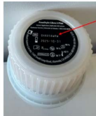
Sensor Applicator label