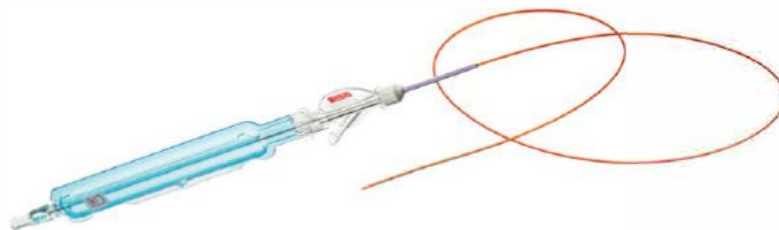
Fig.1: Tentos 4F

Contact details of local representative Optimed Medizinische Instrumente GmbH Customer Service [Redacted contact information]