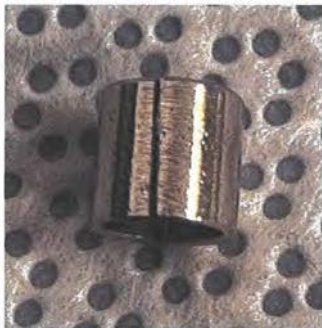
Fig. 2: Bushing with longitudinal fracture

The plateau screw consists of two components, a screw and a bushing that is slid over the screw shaft and pressed into place. The bushing acts as a spacer to the tibial PE plateau.