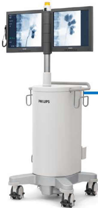
*Fig-1 Mobile Viewing Station (System Identification Label location)

The system product name and model number are found on the system identification label (Fig-2). This label is on the rear side of the Mobile Viewing Station (MVS) (Fig-1).