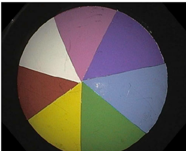
Incorrect color correction data