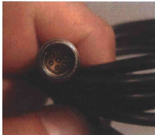
Figure 5: Connector of HL 40 Bubble Sensor (Article no. 701065317)