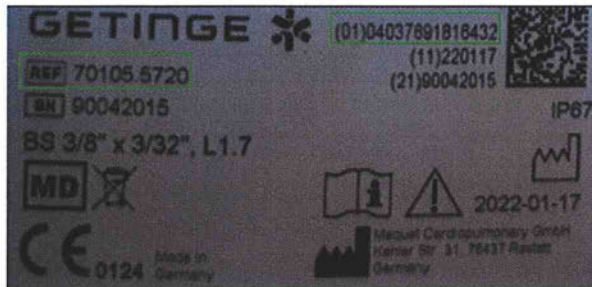
Figure 2: Type label with correct UDI 04037691816432