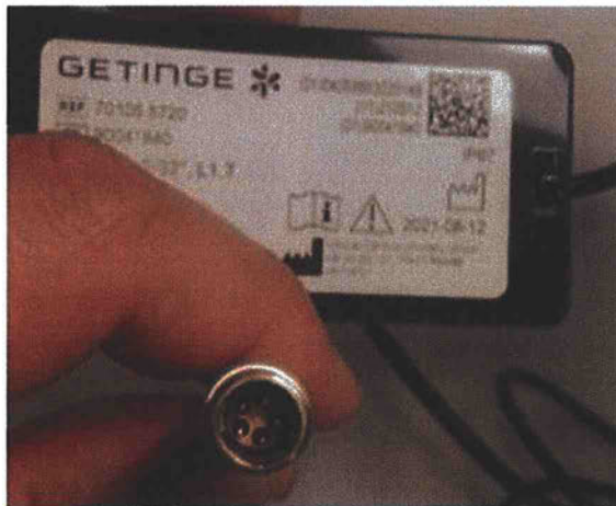
Figure 4: Connector of CARDIOHELP-i/ RotaFlow II Bubble Sensor (Article no. 701055720)

Despite the error on the type label, the outer packaging label of the affected sensors are according to specification and reference the correct UDI 04037691816432 . Therefore, incorrect deliveries of Bubble Sensors due to the issue can be ruled out. Further, a cross-functional use of the two Bubble Sensor is not possible due to a difference in design (Figure 4, Figure 5).