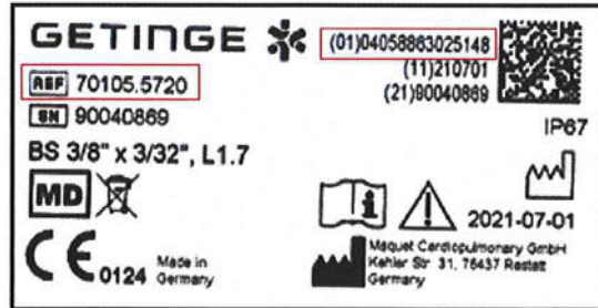
Figure 3: Type label with incorrect UDI 04058863025148

In fact, UDI 04058863025148 belongs to HL40 Flow Bubble Sensor FBS 3/8"x3/32" L2.0 (Article no. 701065317) (Table 1).