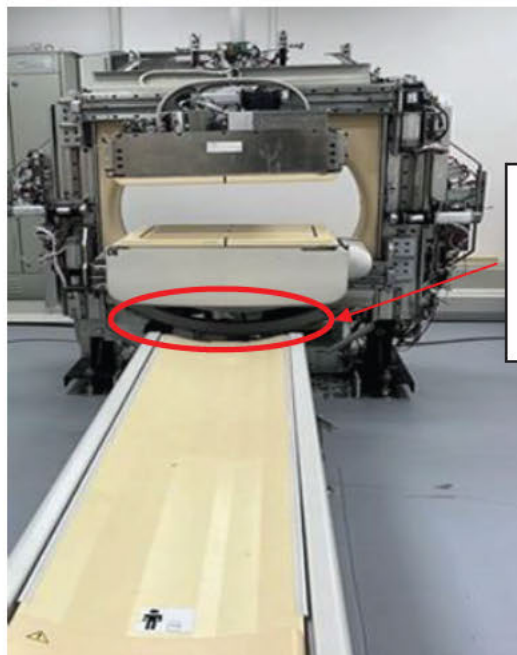
Figure 1. Image of gap between the patient support and detector

Gap between the detector and patient support. During PPM, the gap may decrease creating the potential for extremity entrapment.