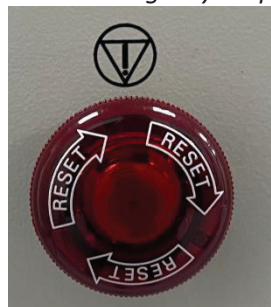
Figure 3. Emergency Stop