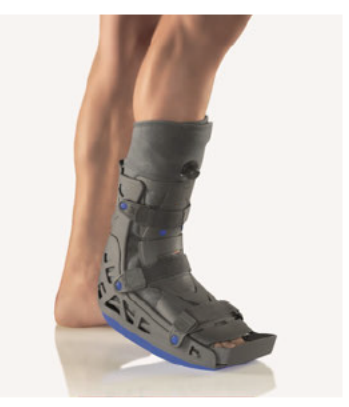
101350 Bort X-Walker short