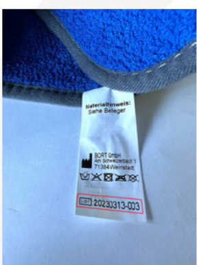
textile sew-in label