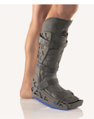
101320 Bort X-Walker Achillo