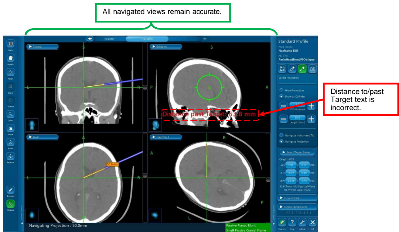
Figure 2 Distance to/past Target Text Inaccuracy seen in Navigate Task of NexFrame™ DBS