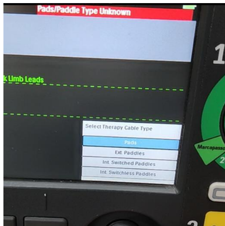
Figure 1: Screen display from DFM100 experiencing paddles misidentification issue.

The Efficia External Paddles may not be properly identified by an Efficia DFM100 or HeartStart Intrepid Monitor/Defibrillator when connected to the device. The device may display an error message reading “Pads/Paddle Type Unknown” as shown in Figure 1. When this occurs, it is accompanied by a menu prompting the user to select a therapy cable type, also shown in Figure 1 below. The message cannot be cleared until the user either selects the cable type, disconnects and reconnects the cable, or restarts the device.