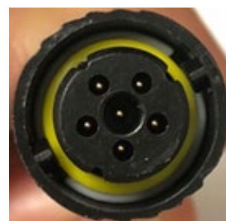
Figure 2 - Front view of Power Source Connectors

Below is a summary of the changes to the cleaning instructions for the Controller AC Adapter, DC Adapter, and Battery: