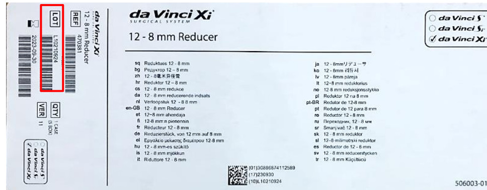
Figure 2: Example of lot number location on shipper box

To help you identify the lot, the image below shows where to find the lot number on the da Vinci Xi and X 12-8 mm Cannula Reducer carton package labeling (shipper box and inner carton label).