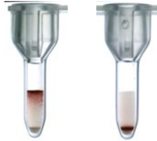
Figure 1: Examples of an expected positive (left image) and expected negative (right image) results when using the impacted ID-Cards.