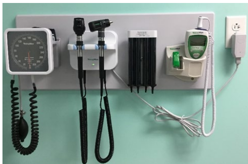
GS777 Wall Transformer