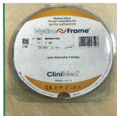
✓ - Product with Manuka Honey label