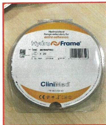
X - Product Without M.anuka Honey label