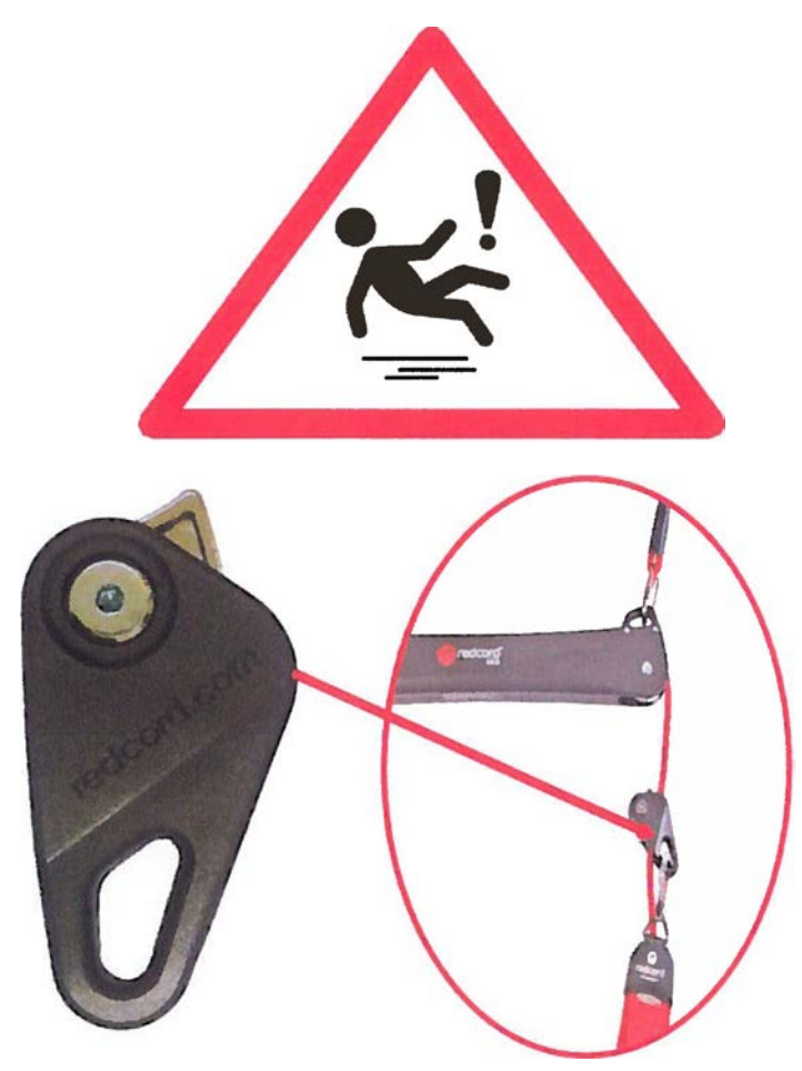
Rope loek in Redcord Axis 110050

Defect In some cases the casing inside the rope loek may crack or break the rope loek.