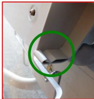
Figure 1D - Good Latch