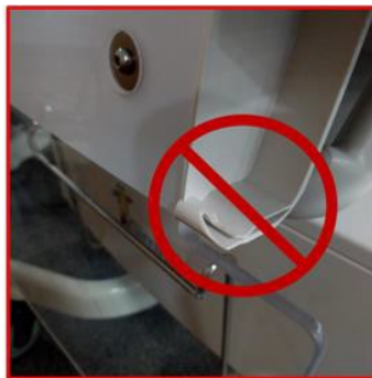
Figure 1C - Broken Latch