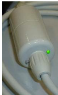
Figure 1 Green LED indication of function

In the course of post market surveillance activities it has been observed that the Connection Leads are potentially affected by a malfunction which has a correlation to massive temperature fluctuations. The malfunction can be observed as the connection lead has no power output, thus not charging the pump. This failure can be easily detected by observing the LED indication of the Connection Lead which signs the cable is functional or not.