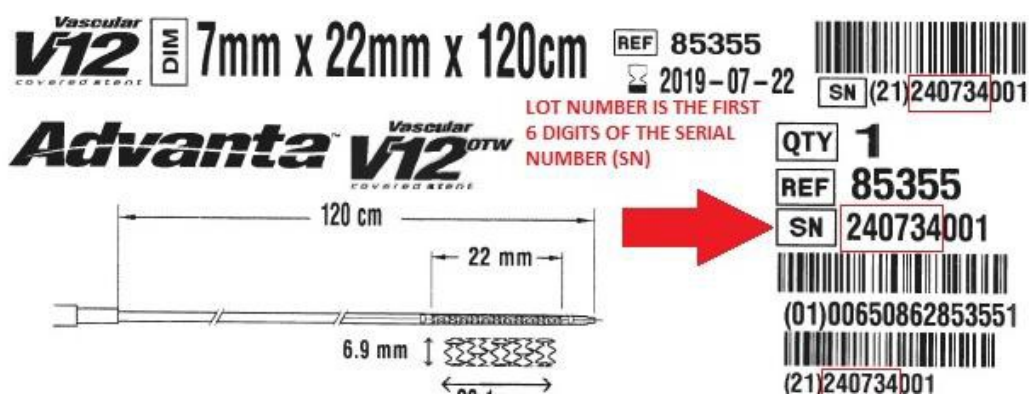
Figure 3 – Advanta V12 Covered Stent part number 85355 with Location of Serial and Lot Number

NOTE: The Advanta V12 Covered Stent lot number is listed on the product packaging label as the FIRST SIX (6) DIGITS of the serial number (SN). Please locate the serial number (SN) on the packaging label of Advanta V12 Covered Stent product code / part number 85355 in order to identify the lot number. A representative Advanta V12 Covered Stent packaging label, with lot number outlined as the first six digits of the serial number (SN), is provided in Figure 3 , below.