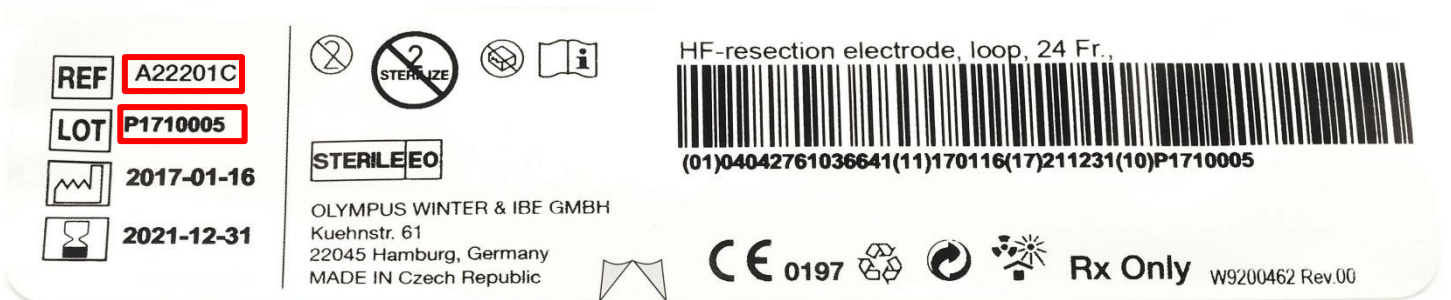
Picture 7: model (REF) and lot (LOT) number on the blister packaging label