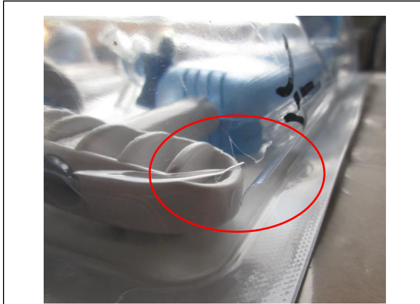
Picture 1: Example of crack observed near the inflation device handle

ArcRoyal has been informed by Perouse Medical, the manufacturer of the Inflation Device 30ATM, of a potential defect in the device primary packaging (blister), which may compromise the device sterility. Low level instances have been reported of the blister showing a clearly visible crack located near the handle or the pressure gauge.